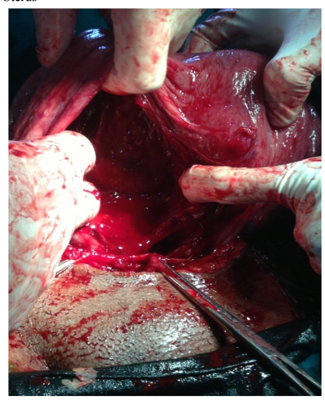
Figure 1: Intraoperative Photograph Showing the Space occupied by the Gestational Sac Relative to the Uterus

a rubber drain left in-situ. Blood loss was estimated at 2500ml. She had 3 units of blood transfused. Her recovery was satisfactory; post-operative packed cell volume was 30%. She was discharged from the ward on the fourth post-operative day.