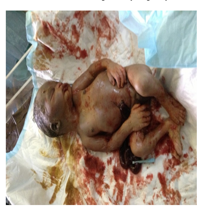
Figure 3: Photograph of a Term Fresh Male Still-Birth Delivered after a Term Interligamentary Pregnancy.