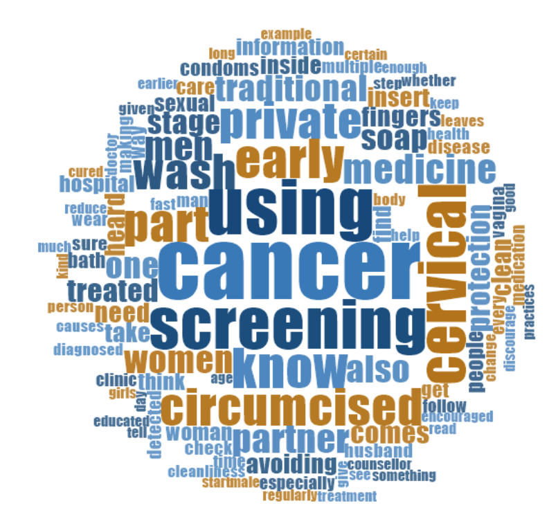
Figure 2: Word cloud showing how frequent early cervical cancer screening was mentioned