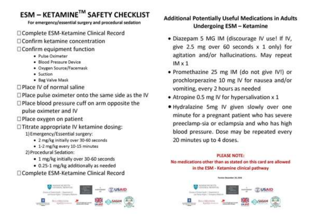
Figure 1: ESM- Ketamine Pocket Checklist (front and back)