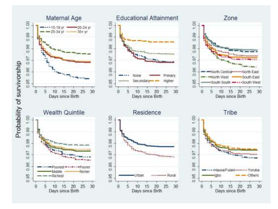
Figure 1: Neonate survivorship curves by mother's background characteristics

higher hazards (HR=1.49) for neonatal mortality. The association between low birth weight due to prematurity or intrauterine growth retardation and NNM is well established in literature<sup>22-24</sup>. The causes of low birth weight are multifactorial which include maternal age, maternal nutrition (measured by maternal height, pre-pregnancy weight, and gestational weight gain), socio-economic status, birth intervals, multiple pregnancies, cigarette smoking, alcohol consumption and maternal infections<sup>25-26</sup>. Malaria infestation is distinct because it is the most important preventable cause of LBW during pregnancy in malaria endemic areas<sup>27</sup>. This association has been partly attributed to placenta parasitaemia which elicits an immune response that affects maternal – fetal transfer of nutrients across the placenta<sup>28</sup>. Eisele et al , in their meta-analysis of malaria prevention in