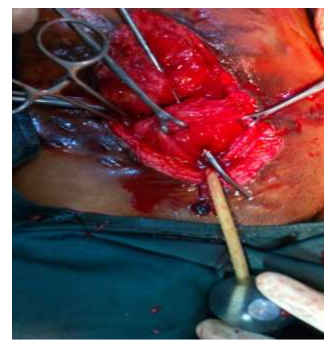
Figure 2: The bladder was opened during surgery and defect on the bladder was then identified

enterovesical fistula may be surgical or non surgical<sup>8</sup>. Our patient had operative management with good outcome.