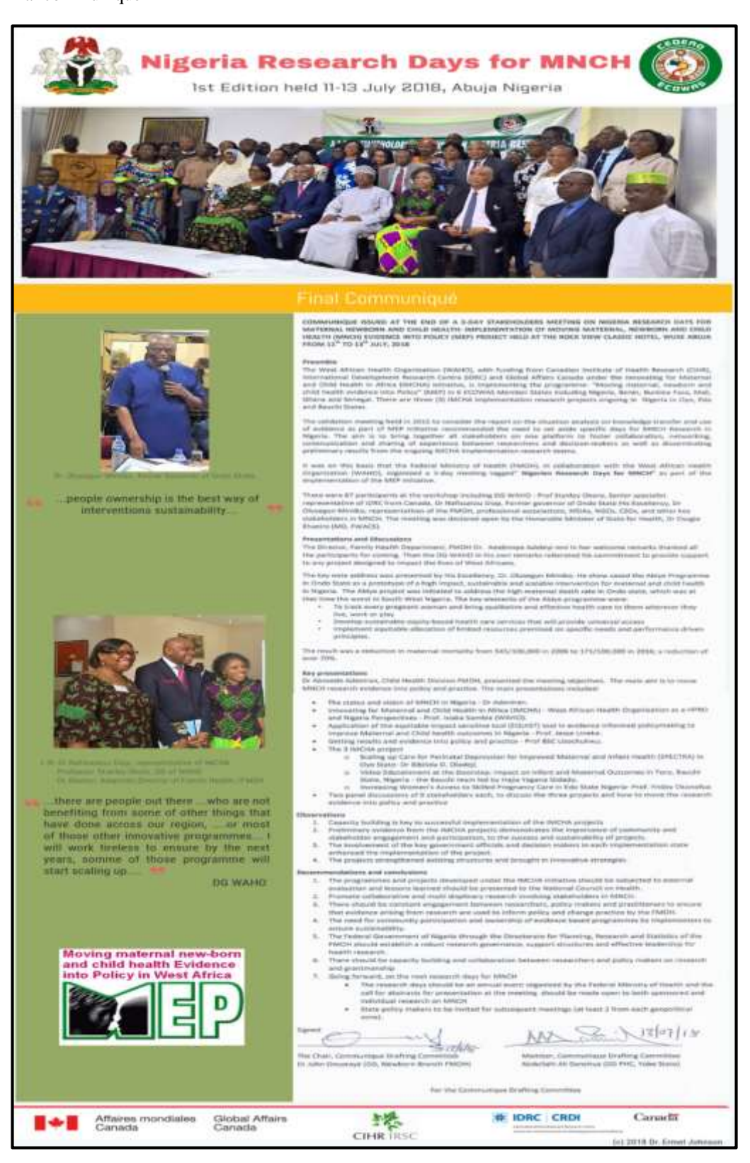
Box 5: Final communiqué