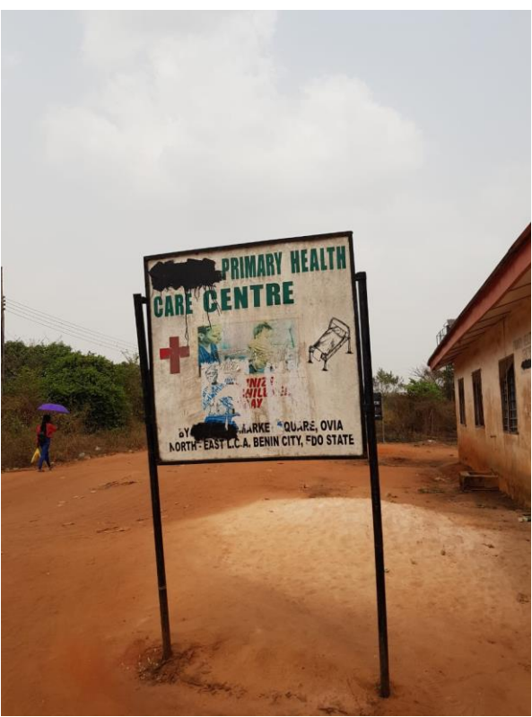
Figure 3: WASH facility in a PHC in Edo State, Nigeria (WHO 2019)<sup>5</sup>

include decision-makers from relevant ministries (health, water, sanitation, infrastructure, public works, and finance) as well as technical staff and partners engaged in WASH in the PH-C activities. The first assignment of the Edo State taskforce team is to set targets and define a roadmap for WASH in PHC facilities based on the situation analysis and assessment, and taking into consideration the special needs of vulnerable groups and underserved areas and facilities.