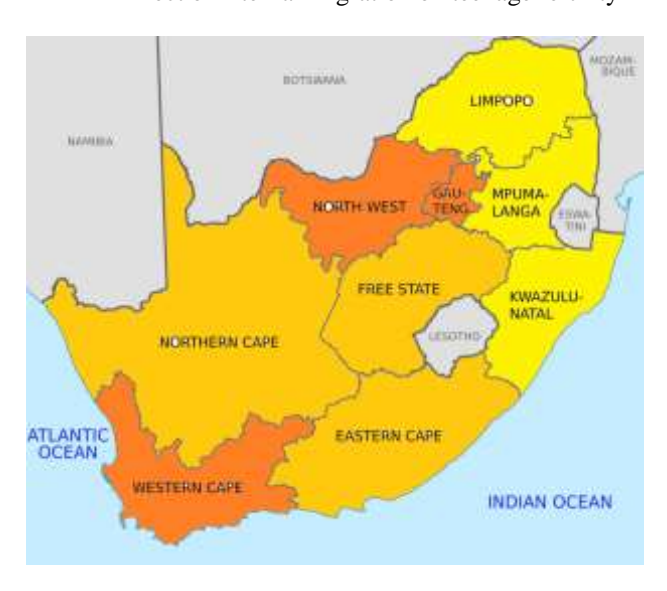
Figure 3: Levels of internal migration by province in South Africa, 2016 community survey

Internal migration levels by province are shown in Figure 2. Between the years 2007 and 2016 internal migration decreased in the Northern Cape, Mpumalanga and Limpopo while it rose in the Western Cape, Free State and Gauteng. Figure 3 shows internal migration levels across provinces of South Africa for 2016 with lighter provinces having lower internal migration and darker areas having higher levels. Highest levels of internal migration in 2016 were seen in Gauteng, the Western Cape and North West while lowest