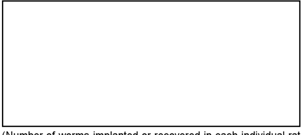
TABLE 4: The effect of immunization with adult worm homogeneate of O. volvulus on transplanted worms of O. volvulus at 30 days

(Number of worms implanted or recovered in each individual rat was as shown in brackets, each figure represents one rat)