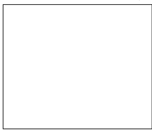
(number of worms implanted or recovered in each individual rat was as shown in brackets, each figure represents one rat)

TABLE 2: The Effect of Passively Transferred Peritoneal Exudate On Survival of O. armillata and O. volvulus at 30 Days