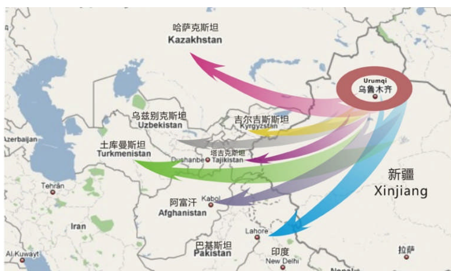
Figure 1: Location of Xinjiang in Central Asian

Based on its complete medical theory system, TUM in Xinjiang has accumulated rich clinical experiences in the past. In treating intractable diseases, TUM has shown distinguished medical methods and unique therapeutic effect. As a traditional ethnic medicine, TUM has made great contribution to not only the health care in Xinjiang but also the medical treatment around China. Moreover, it has benefited the people in the other countries of Central Asia, with their intimate collections of religious beliefs and language (see Figure 1).