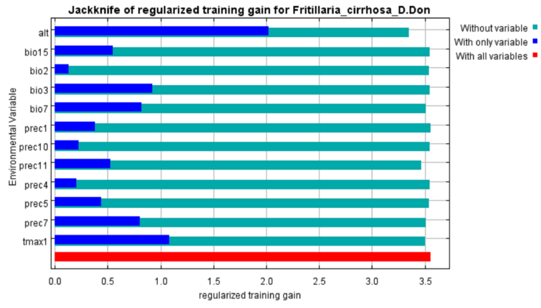
Figure 3: Jackknife of regularized training gain for F. cirrhosa D. Don.

Fritillaria cirrhosa D. Don thrives in cold and wet areas with high altitude. Alt, tmax1, and prec7 were finally determined as the most important environmental variables based on the results of the jackknife test and the biological characteristics of F. cirrhosa D. Don.