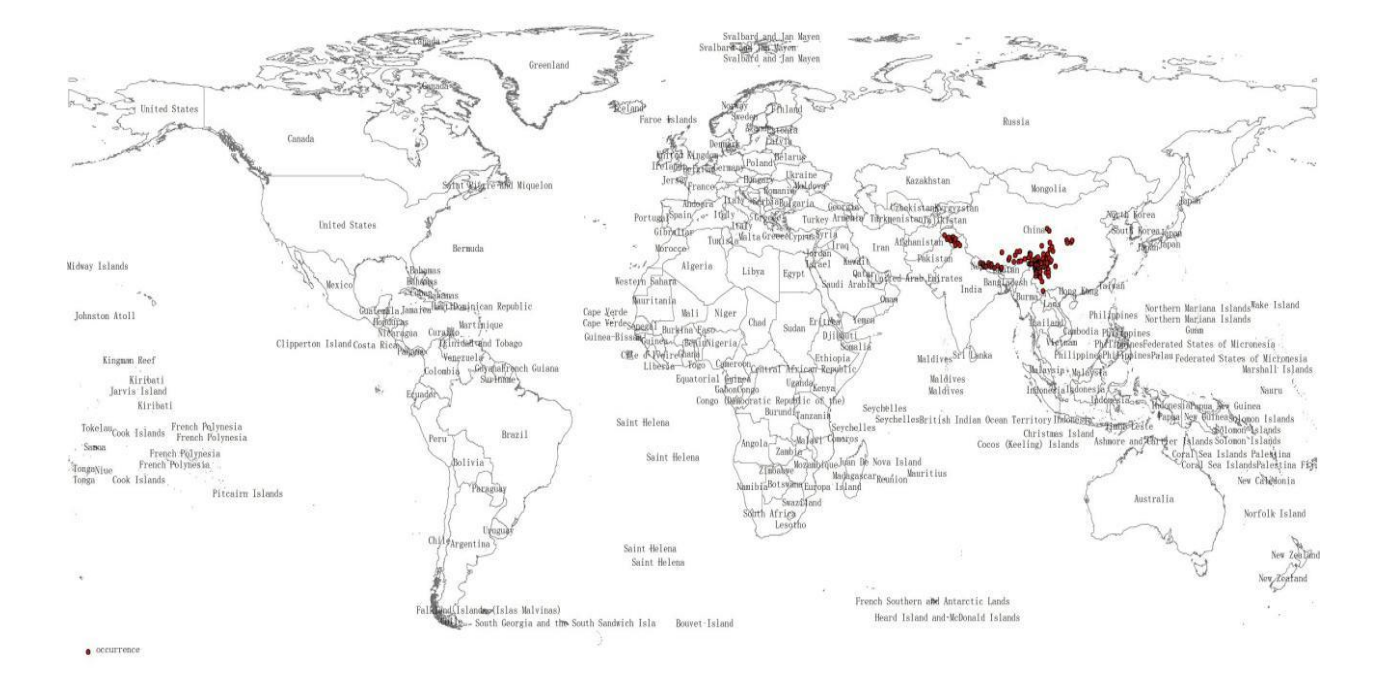
Figure 1: Sample points of Fritillaria cirrhosa D. Don.