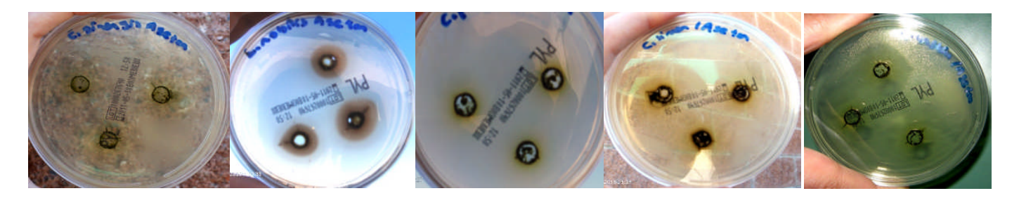
Figure 1: Antimicrobial activity of acetone extracts against, Helicobacter pylori a) C. sinensis , b) L. nobilis , c) C. unshiu , d) C. limon , e) C. paradisi