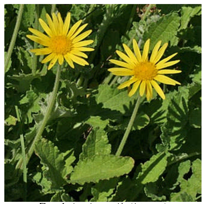
Figure 1: Arctotis arctotoides (Asteraceae)

Arctotis arctotoides is a fast-growing, soft, herbaceous plant with green foliage and butter-yellow daisy flowers almost throughout the year. Each leaf is about 10-15 cm long with a wavy edge and prominent midrib. The stems are about 20 cm long and both the leaves and stems are covered with small white hairs. The single daisy flowers which are borne on the stems are about 4 cm in diameter and contain bright yellow ray florets at the centre. The undersides of the petals are purplish brown and are clearly visible when the flowers are in bud or closed during a cloudy day. The rural people of Eastern Cape Province of South Africa are known to use Arctotis arctotoides for the treatment of epilepsy, indigestion and catarrh of the stomach and the leaf juice or paste of the leaf is applied topically to treat wounds and fungal infections of the skin (Afolayan, 2003; Otang et al.,