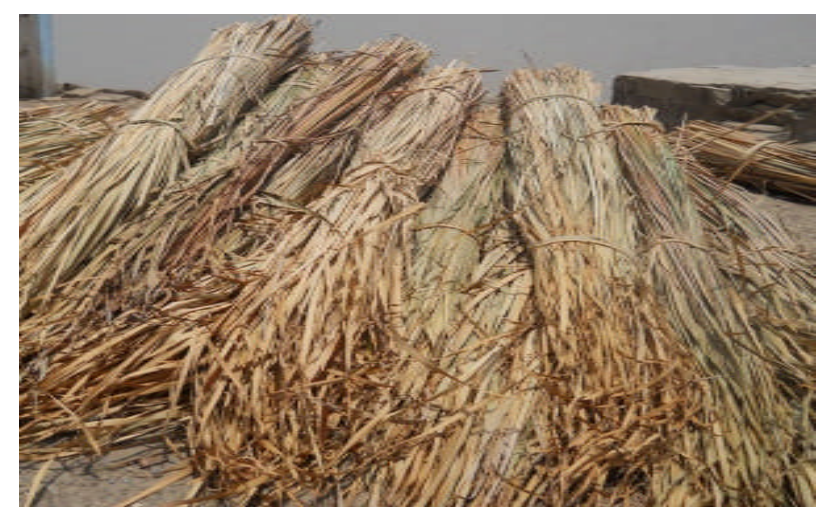
Plate 1: Bundles of Typha plants collected for making mats and baskets

On the basis of above mentioned data, it looks as if Punjab was vastly diversified in having wild aquatic medicinal plants that are being used in Gastrontology (66%), Neurology and Cardiovascular diseases (28%), Respiratory diseases (39%) and Dermatology (17%) in Fig 01. In Punjab, most of the inhabitants have a rural background with an extensive experience in folk medicines as local herbalists and healers. It can be eagerly sought out after the present research work that wetlands of Punjab comprise a significant medicinal flora. The present ethnobotanical survey of aquatic plants of Punjab demands that the ethnopharmacological activities of these plants should be evaluated to support the efforts for the improvement of pharmaceutical industry in terms of natural drug resources for the synthesis of new drugs, that can be very effective against resistant pathogens. This can also lead to the protection of these plants especially from threatening and endangering factors. Most of the young people do not know about such ethnomedicinal uses of the aquatic and semi aquatic plants.