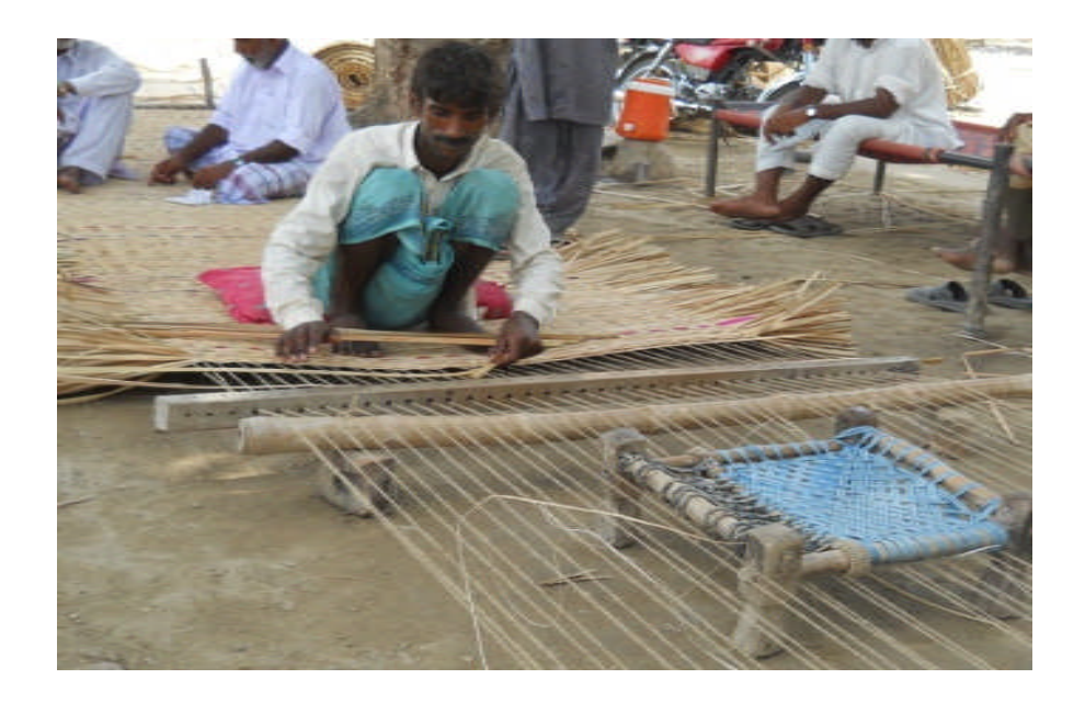
Plate 2: A person making mat from Typha plants

Other than these medicinal values, aquatic plants play an important role in water bodies, as they are the main source of food for zooplankton as Gheese and ducks eat Lemna , Potamogeton , Polygonum species etc. Songbirds use fibres of Typha species to make their nests. Typha plants are also used in making baskets and mats ( Plate 1 and 2 ). Aquatic plants provide shelter to small animals such as aquatic insects, crustaceans, snails etc., that are ultimately used by fishes and waterfowls as food. They are also a source of food for young frogs, salamanders and fishes. Young fishes and amphibians use aquatic plants as cover in protecting them from their predators. They protect shorelines from erosion and alleviate