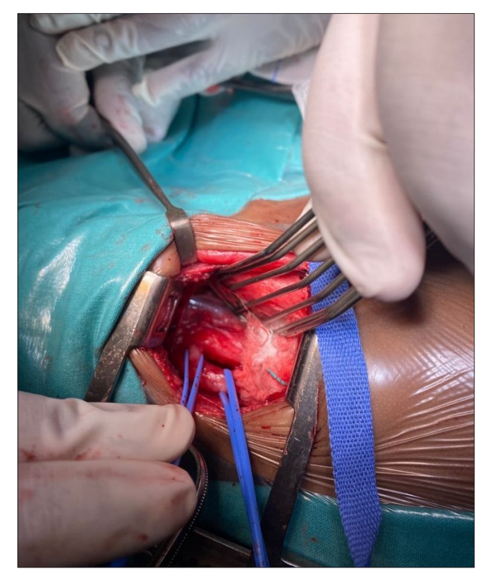
Fig. 2. Intraoperative image of the TOF (left vascular loop) and the oesophagus (right vascular loop). The trachea is visible above the TOF. (TOF = tracheoesophageal fistula.)

On observation in the ward, the infant coughed excessively during feeds, a barium swallow contrast study was performed (Fig. 1) and a fistula was identified between the trachea and oesophagus. The patient was referred to paediatric surgery. Figs 2 and 3 are intraoperative images. Postoperatively, she recovered well and was discharged home after 2 weeks. At the time of publication of this report, the infant was clinically well, gaining weight and no further cough had been observed.