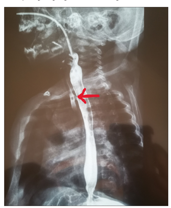
Fig. 1. Barium swallow contrast study of the H-type tracheoesophageal fistula (red arrow).