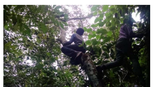
Photo 1. Indigenous climbers on Albizia ferruginea in Loumou (Pool department), © Germain Mabossy-Mobouna, 27/07/2019.