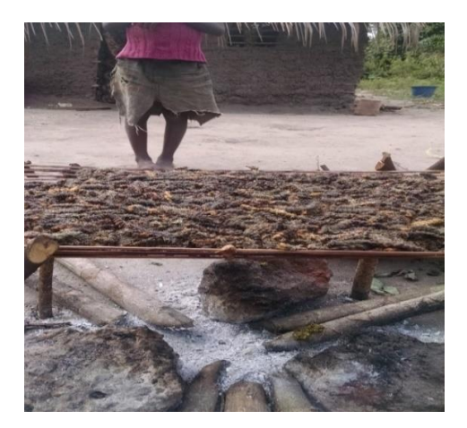
Photo 9. Claie of the smoking of Imbrasia epimethea caterpillars in Wongo-Ouest village (Likouala Department). © Germain Mabossy-Mobouna, 04/08/2016.

Caterpillars are collected alive and placed in containers during harvesting. Once the harvesters return to the village or camp, the caterpillars are lightly boiled in large pots and then spread out on racks (Photo 9) where they are smoked for two to three days.