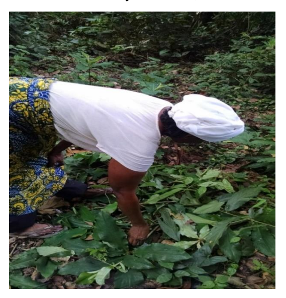
Photo 3. Collection of Imbrasia truncata caterpillars by a Bantu woman in Wongo Ouest (Likouala Department). © Germain Mabossy-Mobouna, 04/08/2016.