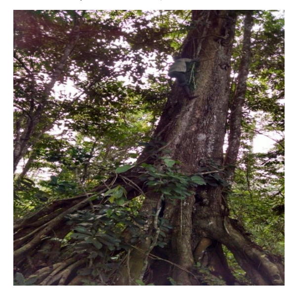
Mabossy-Mobouna et al., 2022

Photo 4. Native climber on Uapaca guineensis in Wongo Ouest (Likouala department). © Germain Mabossy-Mobouna, 04/08/2016.