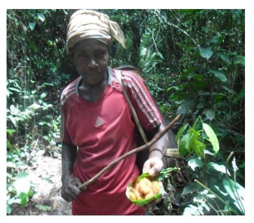
Photo 8. Bantu woman leaving the harvest of "Emuala" caterpillars in Etoumbi (West Cuvette Department). Germain Mabossy-Mobouna, 17/10/2015.