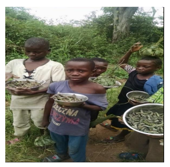
Photo 7. Young Bantu people emerging from collecting Gonimbrasia melanops caterpillars in Wongo Ouest (Likouala Department). © Germain Mabossy-Mobouna, 04/08/2016.

Photo 6. Two young indigenous girls collecting Gonimbrasia melanops caterpillars in Ipendja (Likouala Department) © Germain Mabossy-Mobouna, 12/08/2017.