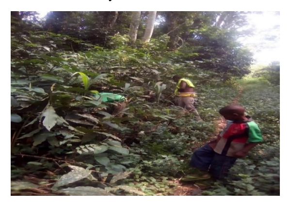
Photo 2. Caterpillar collection by Mbendjele indigenous people in Pokola (Sangha Department). © Germain Mabossy-Mobouna, 12/08/2017.