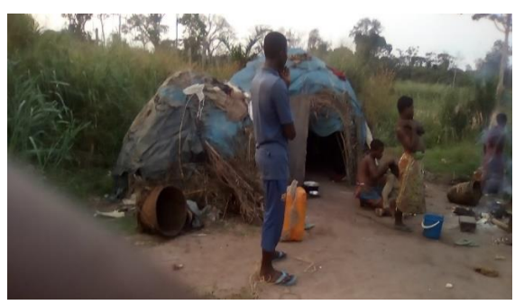
Photo 5. A young Bantu visiting the camp of indigenous Baaka harvesters in Ipendja (Likouala Department) © Germain Mabossy-Mobouna, 12/08/2017.