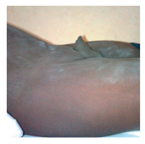
Figure 1 A conically shaped short penis with complete prepuce.

urinary incontinence (Fig. 3). A diagnosis of penile epispadias with complete prepuce was made.