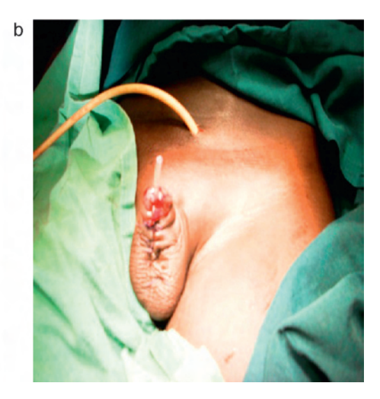
Figure 5 (a) Degloved penis showing a penile epispadias and (b) appearance of penis after completion of repair.

complain of persistent nocturnal enuresis or continuous dribbling). The clinical signs that may raise the suspicion of this condition have been described in literature [1,5]; a short penis with a broad spade like glans, absence of frenulum, and penile raphe on the glans and a dorsally directed preputial opening. A dorsal midline depression with separation of the corporal bodies could be felt on palpation. Our patient presented at the age of seven years and the chief complaint of the parents was incontinence. The presence of a complete prepuce, a moderate sized penis and the absence of significant dorsal chordee contributed to the late presentation in this case.