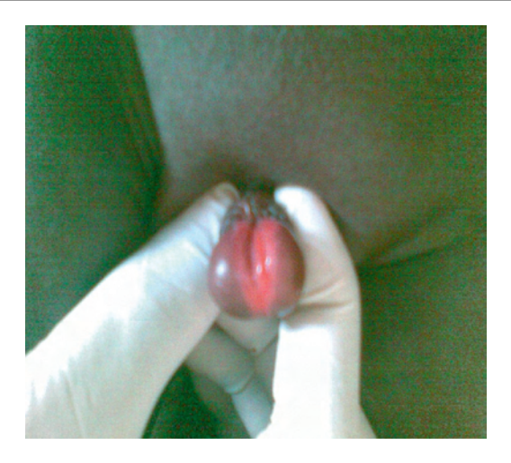
Figure 3 Penile epispadias on preputial retraction.

on the 7th day. Patient was followed up in the outpatient clinic at intervals and at three months post repair, he was still dribbling urine between good volitional voids. The persistent incontinence was to be addressed by a later bladder neck reconstruction.