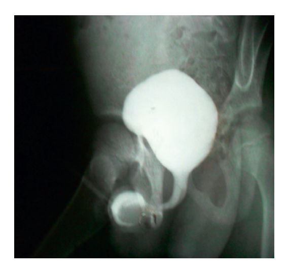
Figure 4 MCUG with ballooned prepuce.

It is often associated with late presentation because the diagnosis can be missed during the neonatal period [4] due to the apparent normal appearance of the penis. This is because the complete prepuce conceals the penile anomaly and preclude early detection, therefore these patients may only present when it is discovered at circumcision (where routine religious/cultural circumcision is practiced), when the child is noticed to have an abnormally short penis for his age or during evaluation for incontinent of urine (when the parents