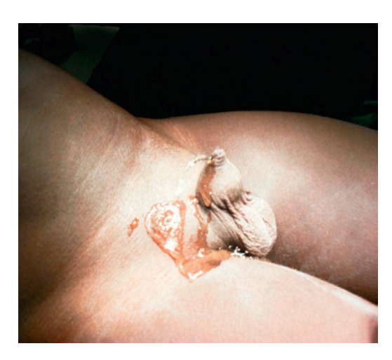
Figure 2 A dorsally directed pretucial opening and ballooning of the prepuce on micturition.

At repair a circumcising incision was made and the penis degloved to reveal the entire extent of the defect. An inverted U shaped incision was made around the urethral plate without complete mobilization of the plate. The urethral plate was closed over a 10 French tube (Byar's urethroplasty) and the corporal bodies approximated over the reconstructed urethra. Chordee was surprisingly mild and did not require correction, thus induction of artificial erection was not required. Skin cover was easily achieved with the abundant circumferential penile skin, suprapubic urinary diversion was done (Fig. 5a and b). Postoperatively, he voided with good stream after removal of the urethral stent on the 4th day and suprapubic drain was removed