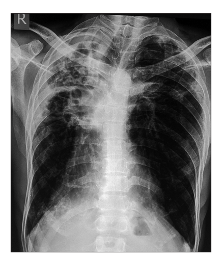
Figure 1: Chest X-ray posteroanterior view: Right upper lobe pulmonary fibrosis and tracheal shift to the right side with secondary infection

Aundhakar, et al.: "Watch out!!: Pneumonia secondary to Achromobacter denitrificans"