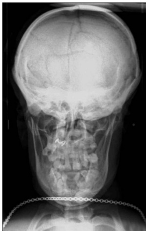
Figure 5: Posterior-anterior view of skull reveals brachycephalic, light bulb like shape of the skull