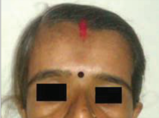
Figure 1: Brachycephalic skull with depression in frontal bone of skull

In 1898, Mane and Sainton were the first to describe cases of this disease and associated them with patterns of inheritance. Later Bauer and Kallialla suggested genetic mutation as an