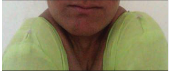
Figure 2: Hypermobility of both shoulders