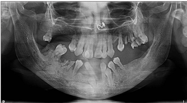
Figure 3: Orthopantomogram revealed impacted permanent teeth, rounded gonial angle with absence of antegonial notch