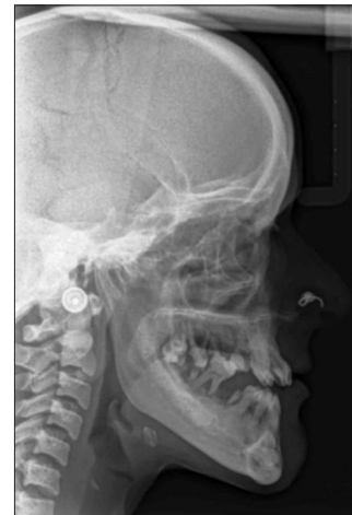
Figure 4: Lateral cephalogram revealed non closure of sutures, wormian bones, hypoplastic maxilla, depressed nasal bridge, non-pneumatization of frontal sinuses