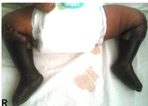
Figure 3: Image showing gangrenous process involving the lower limbs of case reported, Titled: Figure 3: Bilateral symmetric peripheral gangrene with below-knee level of demarcation.

hypernatraemia in this infant, each of which is a potent predisposing factor for purpura fulminans and DIC, contributed to development of gangrene. Although PF is more commonly associated with meningococemia, [2,7,10] Klebsiella species , found in this case, has previously been reported as a trigger for PF. [3] The progression of ischaemic gangrene is nearly consistent with most descriptions of infectious PF. [2,7] The arterial occlusions observed contrasts with the commoner micro-vascular thrombosis, which makes this case rather atypical. However, angiography has previously demonstrated similar tibial arterial occlusions at mid-calf, albeit unilateral, in an adult with PF, who survived following above-knee surgical amputation. [5] The haematologic and coagulation derangements along with thrombocytopenia observed suggested DIC. However, the lack of Protein C, Protein S, Anti-thrombin III, plasma and urinary FDPs assays constituted major limitations to completeness of laboratory evaluation in this infant, especially as these parameters are useful for confirmation and staging of DIC. [2,3,7,9]