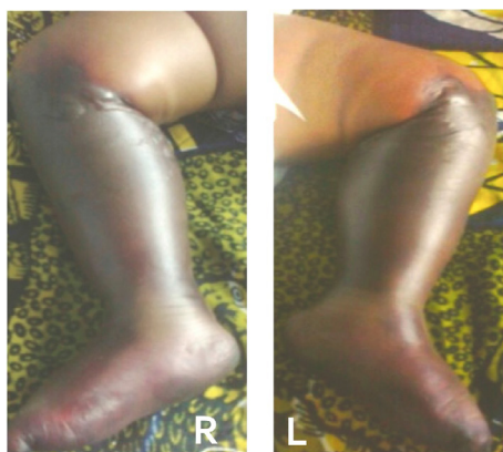
Figure 1: Image showing extensive ischaemic process involving Lower limbs of case reported, Titled: Figure 1: Erythema and ischemic changes with oedema and blisters below the knees.

His condition gradually stabilized, evidenced by adequate urine output and improved vital signs, while the diarrhoea stopped by the third day when he regained consciousness and was breastfeeding, even though still irritable with intermittent inconsolable cry. A crop of erythematous macules and ecchymotic patches began to appear over the soles and the legs symmetrically, associated with tenderness and non-pitting oedema. The proximal margin of the lesion was demarcated from proximal healthy tissue by a zone of blisters lined circumferentially at the level of the tibial tuberosity. The popliteal and dorsalis pedis pulsations were not palpable on either side while other pulses were normal. The erythematous lesions gradually merged with adjacent healthy areas within 24 hours [Figure 1].