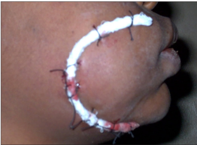
Figure 3: Compression device of flexible stainless steel