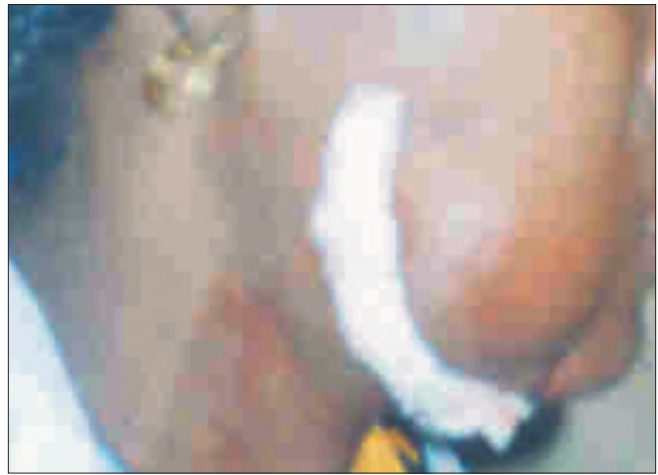
Figure 2: Photograph showing compression device (plastic spatula)