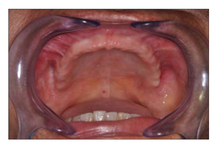
Figure 5: Regular follow-up and there were no recurrence

the full length of the maxilla after reviewing the patient for any medical condition. The tissue was infiltrated with local anesthesia containing adrenaline 2% and posterior superior alveolar, infraorbital and greater palatine nerve blocks were given. Using a no. 15 surgical blade an outline for resection in a wedge shape was made along the length of the lesion. The resection was then carried out from the midline till the posterior tuberosity region. Hemostasis was achieved. The field was cleaned with betadine and saline solution. A primary closure was achieved using 3-0 vicryl suture material [Figure 2]. Postoperatively, antibiotics and analgesics were prescribed. The patient was instructed not to wear the denture and rinse