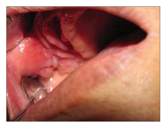
Figure 1: Multiple hyperplastic tissue folds in the right maxillary buccal vestibule