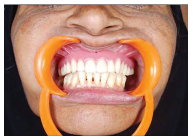
Figure 4: The new denture was fabricated after one month

the mouth with chlorhexidine mouthwash. The excised specimen [Figure 3] was sent for histolopathological examination. It revealed hyperplastic epithelium in most of the areas, and the underlying connective tissue was fibrous, with moderate inflammatory infiltrate consisting of predominantly lymphocytes. The patient was recalled for follow-up after a week and the healing was satisfactory. The new denture was fabricated after 1 month [Figure 4]. The patient is on regular follow-up for 6 months and there was no recurrence of the lesion till date [Figure 5].