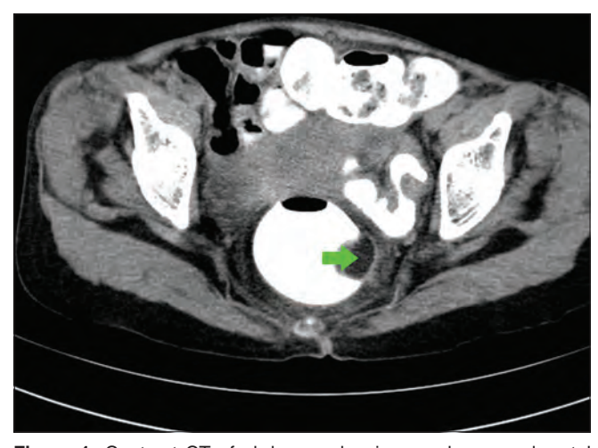
Figure 1: Contrast CT of abdomen showing a sub-mucosal rectal mass (green arrow)

Lipomas of the large intestine are relatively uncommon in clinical practice. Most of them are incidentally detected during