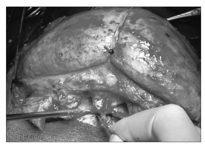
Figure 4: Carpeting by dura and autologous dural patch to repair anterior cranial fossa