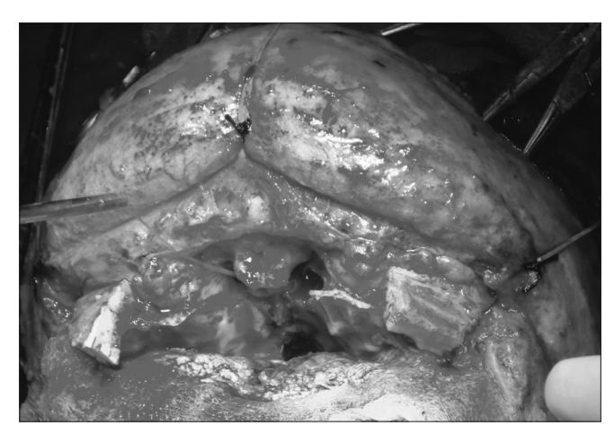
Figure 2: Traumatic fracture of frontal bone and cribiform plate (Case 2)

Jennett and Miller<sup>[3]</sup> studied 359 patients with compound depressed fractures. They overall infection rate for cases done more than 48 hours after injury was 36.5%.<sup>[6]</sup> This included