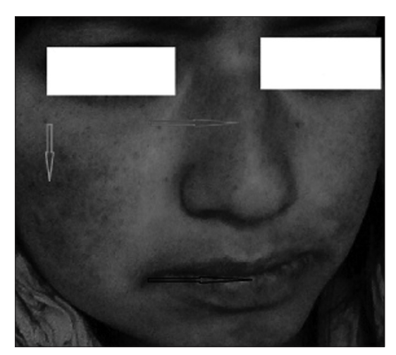
Figure 1: Clinical photomicrograph showing Dark brown rash over face (red and green arrows) and dark pigmentation over lips (black arrow)

steroids. Serum antiadrenal antibody test showed results as 3 U/ml (normal range < 1 U/ml). Patient showed dramatic improvement in clinical parameters and hemodynamics. Morning cortisol levels were 7.5 \mu g/dl (normal range > 15 \mu g/dl). A short synecthen test (SST) using 250 mcg synecthen carried out after stopping steroids showed 30 min value of 10 \mu g/dl and 60 min value of 12 \mu g/dl. Computed tomographic scan of the abdomen was normal. Thyroid function test was normal. Antithyroid peroxidase antibody levels were normal.