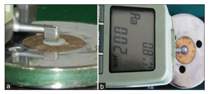
Figure 3: (a) Placement of the stylus. (b) Surface roughness (Ra) readings using profilometer

for all the samples and were exposed to fresh solution for the next 24 h.