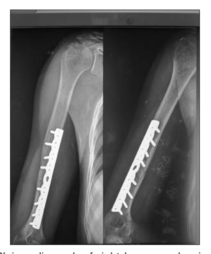
Figure 2: Plain radiograph of right humerus showing congruent reduction of the shoulder joint and the fracture fixed with low contact dynamic compression plate