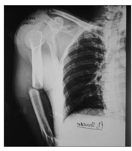
Figure 1: Plain radiographs anteroposterior view of the right arm and shoulder showing posterior shoulder dislocation with greater tuberosity fracture with fracture shaft humerus