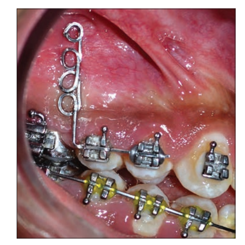
Figure 4: Clinical applications

orthodontic appliance is not disturbed and the implant guide can be disengaged without any difficulty.