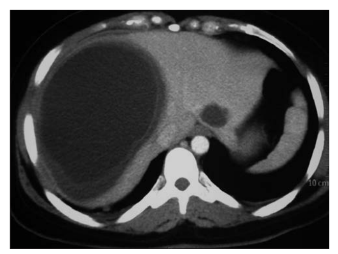
Figure 1: Computed tomography scan demonstrating large homogenous liver cyst