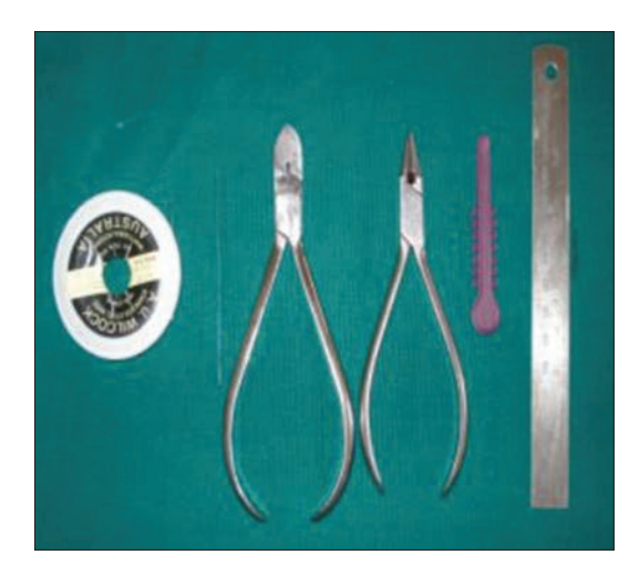
Figure 1: Explains fabrication armemtarium