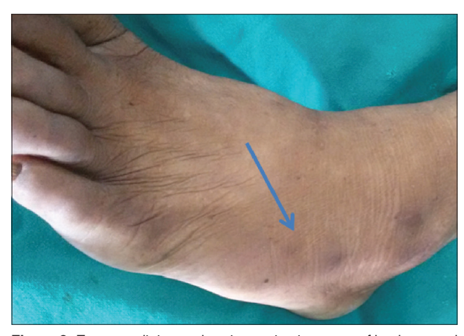
Figure 2: Extensor digitorum brevis wasting in a case of lumbar canal stenosis

On average, the participating patients were 56-year-old (standard deviation [SD] 14.0; age range: 20–88 years). Mean age for lumbar canal stenosis was 56.30 (13.95) (mean: Years [SD]). Male to female ratio was 1.5:1. Mean age for intervertebral disc prolapse (IVDP) in our study group was 27 years (age range from 19 to 46 years). In this study, group ratio of canal stenosis and disc prolapsed was 60:40 among males and 40:60 among females, respectively.