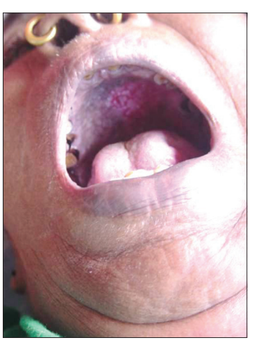
Figure 2: A superficial ulcer of 2 \times 2 cm over the hard palate in the oral cavity with an eroded surface with irregular margins and pseudomembrane formation