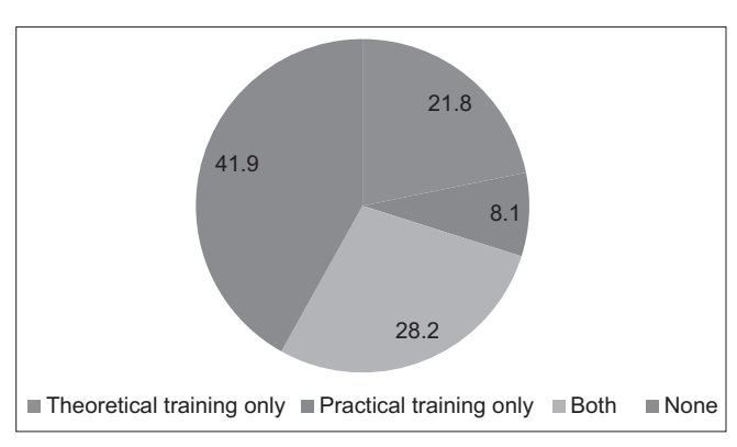
Figure 1: Type of training in the management of medical emergencies received by the respondents

(38/124), endotracheal intubation (59/124), Pulse oximetry (22.4/124), automated external defibrillation (22.4/124), cardiopulmonary resuscitation (69/124) and monitoring of vital signs (76/124).