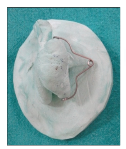
Figure 5: Modified V-loop with helix adapted on the cast

Body piercing, acne, chicken pox, biopsy procedures, lacerations, vaccination especially Bacillus Calmette-Guerin