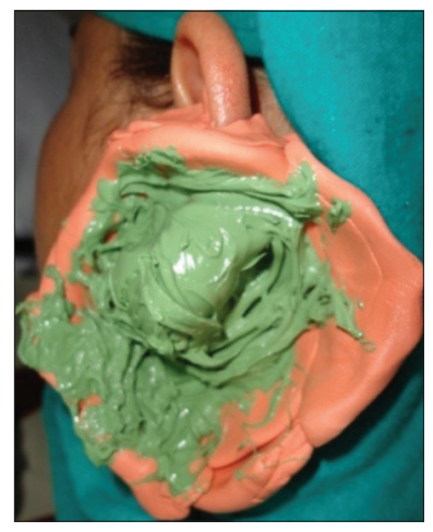
Figure 3: Impression made in light body rubber base impression material