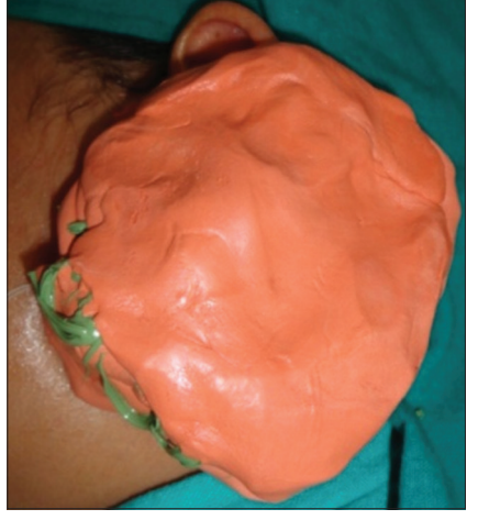
Figure 4: Impression backing made with putty