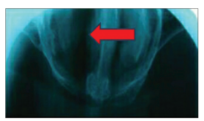
Figure 3: Maxillary occlusal radiograph

placed in the supine position and neck extension achieved by keeping a pillow under the shoulder. Local anesthesia with adrenaline was injected around the lesion for hemostasis. The margins of the fistula were excised to remove the epithelial lining. A palatal flap design was planned based upon the course of the greater palatine artery and marked according to the site and size of the defect [Figure 4]. A partial thickness flap was raised and rotated laterally to cover the defect [Figure 5]. The flap was then secured in its new place using 3-0 black silk sutures [Figure 6]. The donor area which was covered by the periosteum of the palatal bone was the left open for a secondary epithelization. Beta dine dressing was given over the entire area [Figure 7]. One week postoperative review showed that the defect area healed without infection, dehiscence, and the donor site was covered with normal fibrin [Figure 8]. Fifteen days after surgery, the wound in the defect area healed well and the donor site was fully covered with granulation tissue [Figure 9]. Clinical review 2 months later showed healthy pink epithelium covering the donor site on the hard palate [Figure 10]. The bulky palatal flap had shrunk considerably so that the hard palate had retained its normal shape. The patient was referred to prosthodontics for new denture construction.