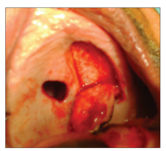
Figure 5: Raising of palatal flap