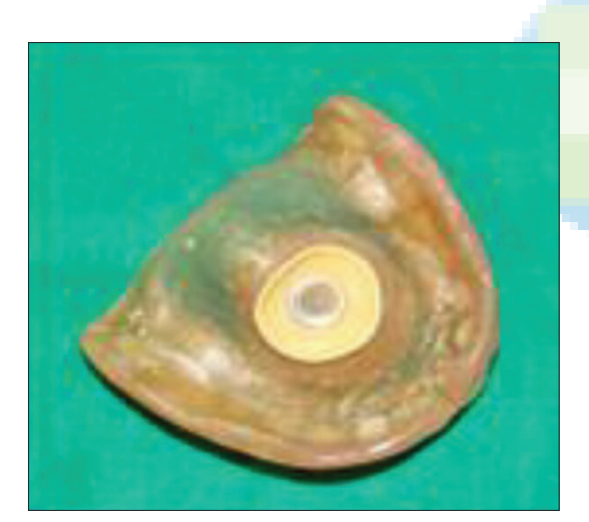
Figure 1: Maxillary suction cup denture

The surgical closure of palatal fistula planned under general anesthesia. It was induced by nasotracheal intubation. Patient