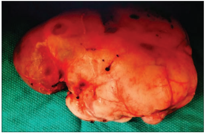
Figure 3: Bilobed, well circumscribed resected perirectal epidermoid cyst measuring 10 cm by 8 cm by 7 cm

Multiple forceful attempts at voiding impacted feces through a stenosed rectal lumen could also irritate the mucosa and cause bleeding. Symptoms of dyschezia and hematochezia may also be due to cyst inflammation or infection while patients may also present with complications such as perianal fistulous