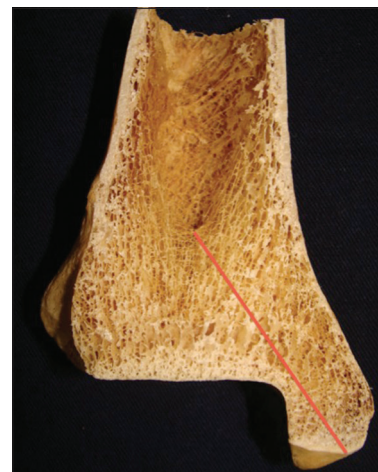
Figure 1: Coronal cut. Red line: Distance between the medial malleolus tip and the medullary canal

Excessively long partially threaded screws can bypass the good cancellous bone in the metaphyseal area and lead to inefficient compression due to poor screw thread purchase inside the medullary canal. An excessively short screw can endanger fracture compression due to screw threads not completely bypassing the fracture site. The present study showed an average distance of 55 mm (SD: 10 mm) between the medial malleolus tip and the start of the medullary canal in 116 Latin American cadavers, with a 10 mm SD. Therefore, when using a typical partially threaded screw (roughly 16 mm of thread length), one can conclude that the ideal screw length is roughly 45 mm for placement of the screw threads in the optimal cancellous bone to generate effective fracture site compression.