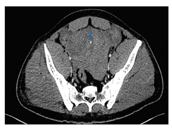
Figure 1: Axial computerized tomography section at the level of the pelvis showing high-density fluid with a suspicious heterogeneous mass on the right side. Punctate hyperdensity (arrow) represents an active bleeding

excised [Figure 2]. No other mass was found and the solid viscera, mesentery and intestines were found to be normal. Post-operative management included regular monitoring of vitals, IV fluids, antibiotics and dressings. The post-operative period was uneventful. The patient was discharged 7 days after the operation. Histopathological examination proved the mass to be a testicular seminoma.