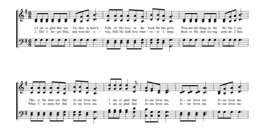
Figure 3b: Original Anglican Hymn No.717