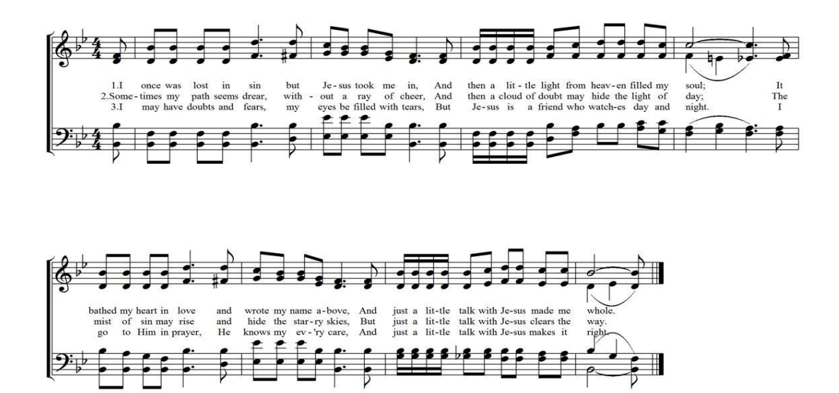
Figure 4c: Original Anglican Hymn No.293