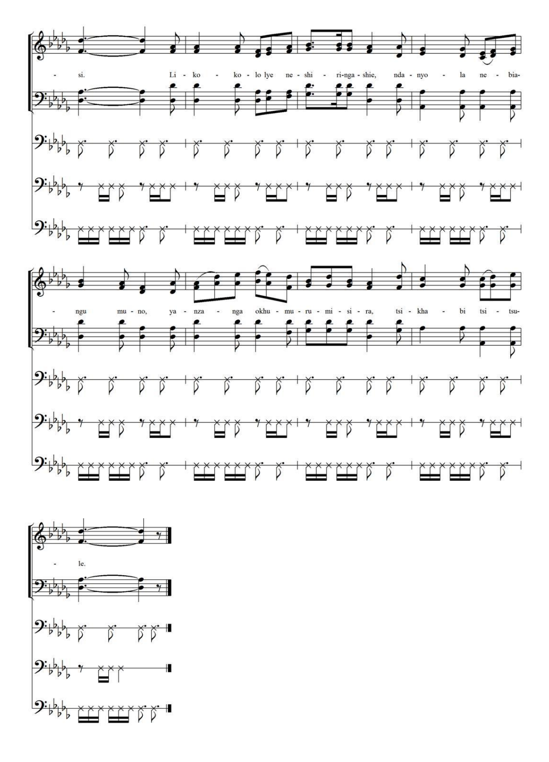
Figure 2a: Luhyia Anglican Hymn No.36

Source: Recorded and transcribed by Geoffrey Akhwesa