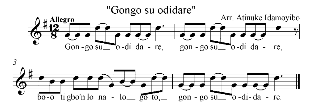
"Gon go su odidare" variation 1. Transcribed by author