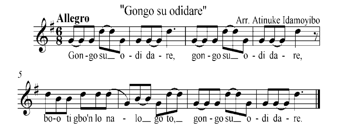
Figure 1. "Gon go su odidare" verbalised drumming in Yoruba land. (Transcribed by the