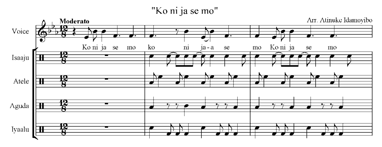
Figure 3. The transcription of "Ko ni ja se mo" by Ishola Opo, with the dùndún ensemble serving as accompaniment.

Repetition is an important feature in street drumming, but the sustaining power of this is accurate variation. A single rhythmic fragment if properly and skillfully varied can be performed repeatedly without the drummer creating an atmosphere of boredom. Drums if made to communicate manifest in reality an atmosphere of artistic matrix that forms the relationship between men, musical arts of drumming and singing, which sometimes transcends the understanding artistic creative ability in man (Hakeem interview 26<sup>th</sup> March 2013). See Figure 3.