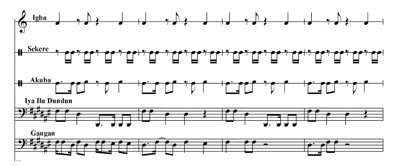
Figure 1. Ina Ran Instrumental accompaniment

Melodic Structure: The melodic structure is quite simple, interestingly tuneful and catchy with ample repetition of notes. No modulation, but implied.