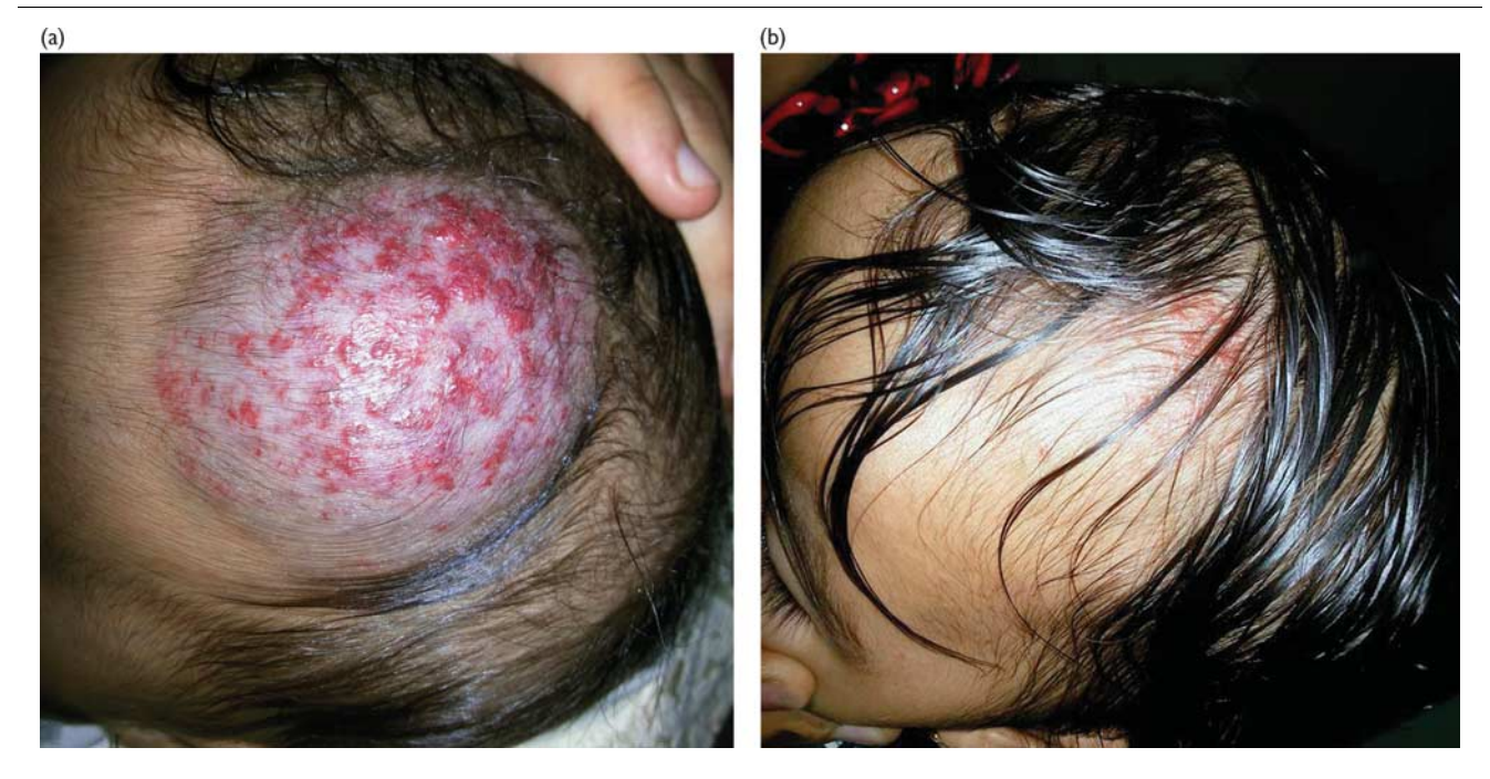
(a) A 4-month-old girl with hemangioma in the upper lip. (b) The same patient (3 months) after receiving oral propranolol (1-3 mg/kg/day in three divided doses) showing (good) final response.

prescribed regimens of 2 mg/kg/day; the dosage has even been doubled to 4 mg/kg/day on observation of no response [16,17]. In the topical group, the ointment was applied three times daily. This regimen was also recommended by Xu et al. [18] and Wang et al. [19] in their studies.