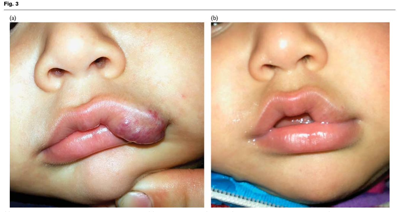
(a) A 3-month-old boy with hemangioma in the scalp. (b) The same patient (9 months) after receiving topical propranolol (1% ointment three times daily) showing (excellent) final response.