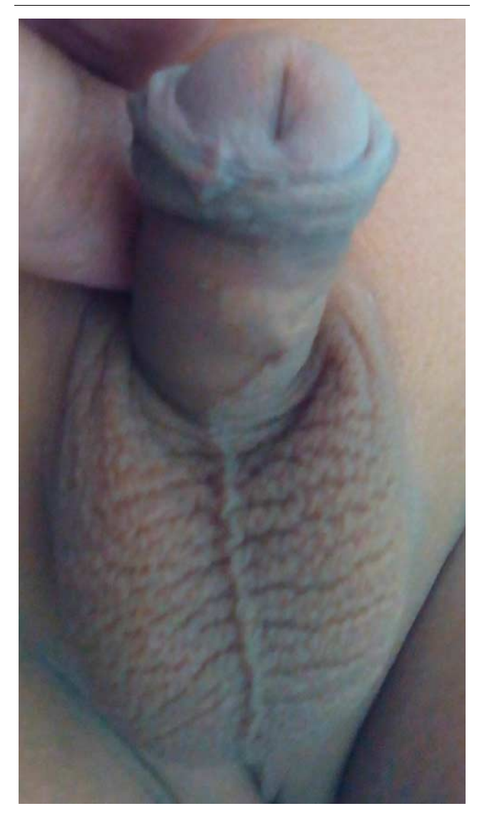
Appearance of the neomeatus following division of the interurethral septum.

are in the long waiting list for DTPA renal scan in resource-limited healthcare system.