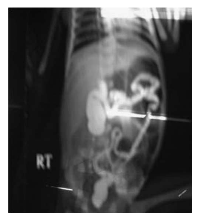
Contrast enema demonstrated cobra head deformity in a case of membranous atresia between the cecum and the ascending colon.

jejunum 20 cm distal to the ligament of Treitz to the midtransverse colon. Three types of colon atresias were found: type III was observed in six (46.2%) patients, type II in three (23%), and type I in four (30.8%).