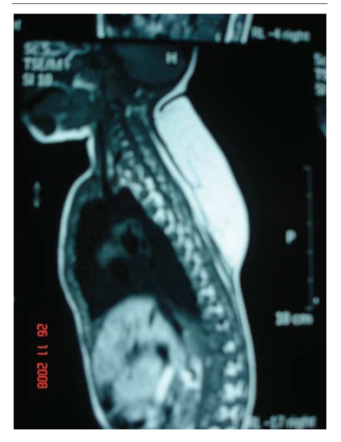
MRI thorax showing a huge lipoblastoma on the back.

the first decade of life. Nuclear atypia and abnormal mitosis are characteristic of liposarcoma, but these findings are unusual in lipoblastoma. Complete surgical resection of tumor with microscopically healthy tissue margins yields excellent prognosis. Recurrence has been reported in 14–25% of cases, [3] usually due to incomplete resection