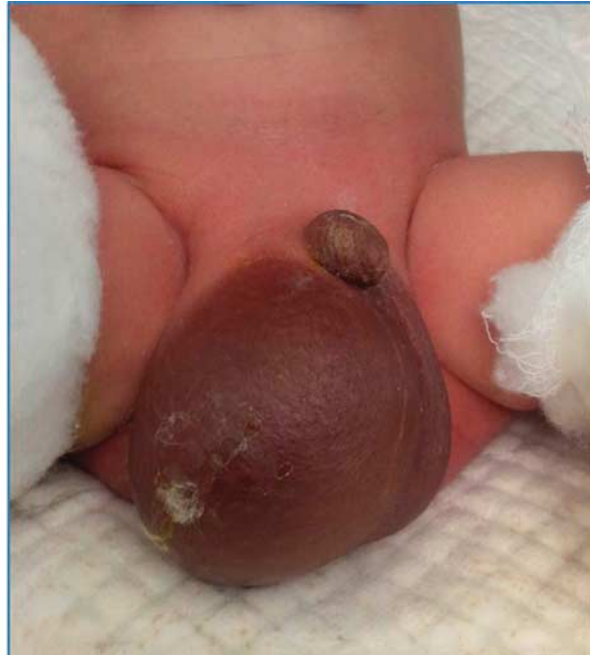
Scrotal and buttock swelling skin discoloration.

hypothesis. However, distal obstruction could not be demonstrated in any of the previous studies [1–9]. Furthermore, there was an FERP demonstrated in a child with duodenal atresia, which precludes above theories [9]. In case of proximal atresia, it is unlikely that intestinal transit would have generated enough pressure to cause rectal perforation.