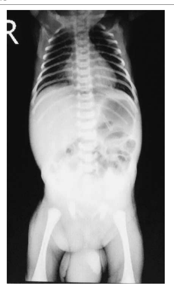
Erect radiograph showing gas in the scrotum.

Investigations recommended depend upon the presentation [1–9]. Most of the clinicians will be encountering this rare entity for the first time. Thus, diagnosing this entity purely on clinical grounds may be difficult [3]. Initial diagnostic imaging modalities recommended are an ultrasound of the perineum, pelvis, and abdomen, and a contrast study of the rectum [3]. The typical findings on ultrasound are of a cavity containing echogenic material