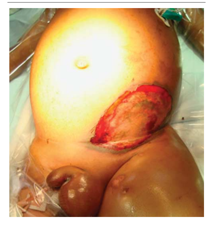
Patient 2: Anterior abdominal wall lesion.

The patient was pancytopaenic, with a deranged liver and normal renal function. Blood culture had previously grown a vancomycin-resistant Enterococcus faecalum and a sensitive Streptococcus oralis for which he was receiving linezolid and meropenem. He was also managed on empirical fluconazole and was receiving granulocyte colony-stimulating factor and interferon.