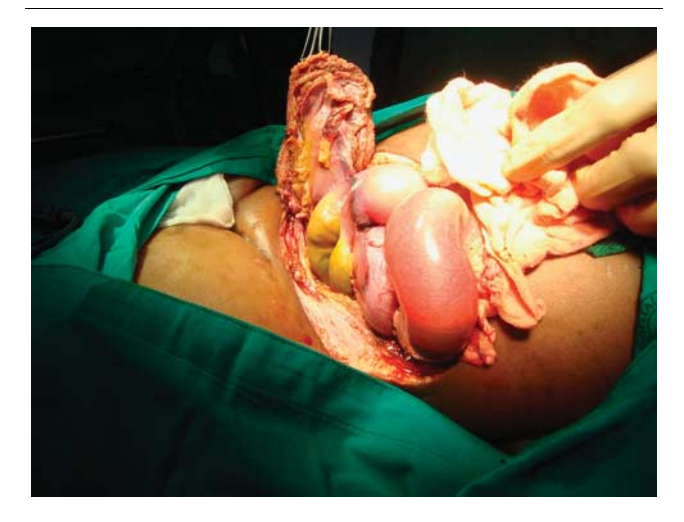
Patient 2: Clinical appearance of the bowel and the abdominal wall at laparotomy.

of the tissue specimens submitted to microbiology for patient 2.