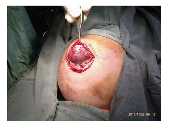
Hydrocolpos main content of umbilical hernia.