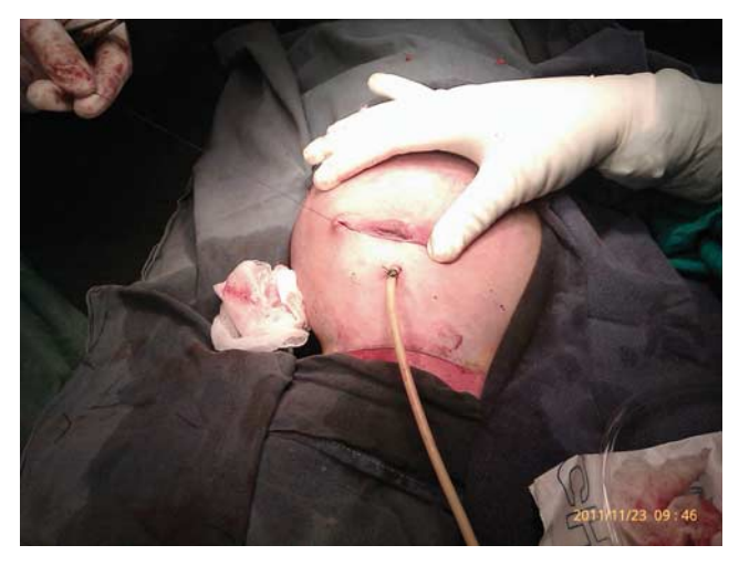
Final wound appearance.

Some surgical entities such as patent urachus or patent vitello intestinal tract are easily approached transumbilically. Curved periumbilical incisions have been utilized for many surgical problems such as pyloromyotomy in case of pyloric stenosis. Umbilicus is also a site for enteric or urinary stoma [1–3]. However, surgery through umbilical hernia is not reported so far. Nevertheless, the optimal time of repair of umbilical hernia is around 3 years of life because before this time majority of umbilical hernias especially with defects less than 1 cm get closed. Bigger defects (> 1.5 cm) have fewer chances to close spontaneously [1]. In our case, the umbilical defect was 4 cm in diameter and a part of cystic mass was herniating through it. As the umbilical defect was quite bigger, no difficulty was encountered in identifying anatomy and performing drainage of the hydrocolpos. We utilized abdominal wall weakness area to perform a surgical procedure followed by repair of that defect. Our approach provided initial management of hydrometrocolpos along with hernial defect closure with the same incision. Moreover, in our experience, bigger hernial defects rarely close spontaneously. Big umbilical hernia, when present, may provide a window to approach abdomen for surgical tasks as we did in the index case.