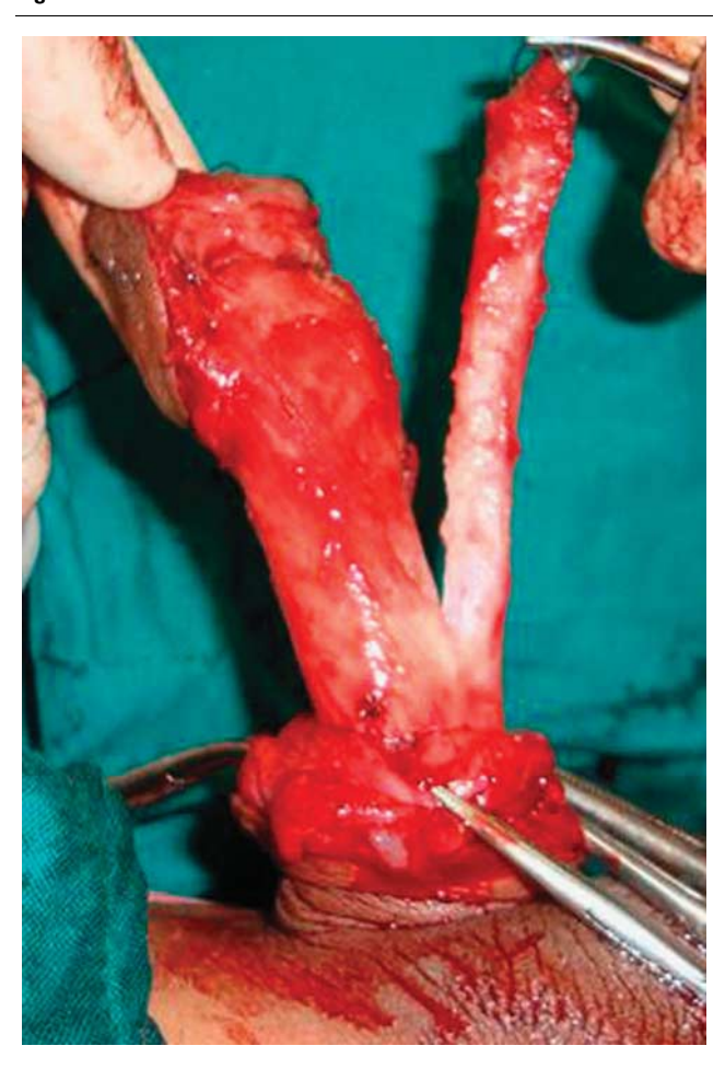
A case that required more proximal mobilization.

and mobilization was started. The distal fanned thin corpus spongiosum was excised. Mobilization was continued through the avascular plane between the corpora cavernosa and corpus spongiosum using the catheter for gentle countertraction. Dissection was continued until a ratio of 4:1 to 5:1 was achieved between the length of the mobilized urethra and the initial distance measured and recorded from the urethral meatus to the distal margin of the glanular groove. Bleeding was controlled with a tourniquet. Glanular wings were developed and adequately mobilized laterally. The separated urethra was then measured against the straight penis. Further urethral mobilization was performed if needed to ensure a tension-free anastomosis between the glans and urethra. A 6-0 absorbable suture was placed on the dorsal aspect of the urethral meatus and through the most distal margin of the glans incision. The urethral meatus was further attached to the glans with interrupted sutures around three-fourths of the dorsal circumference.