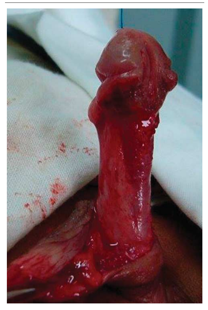
Degloving of the skin and excision of the tissue causing the chordee.