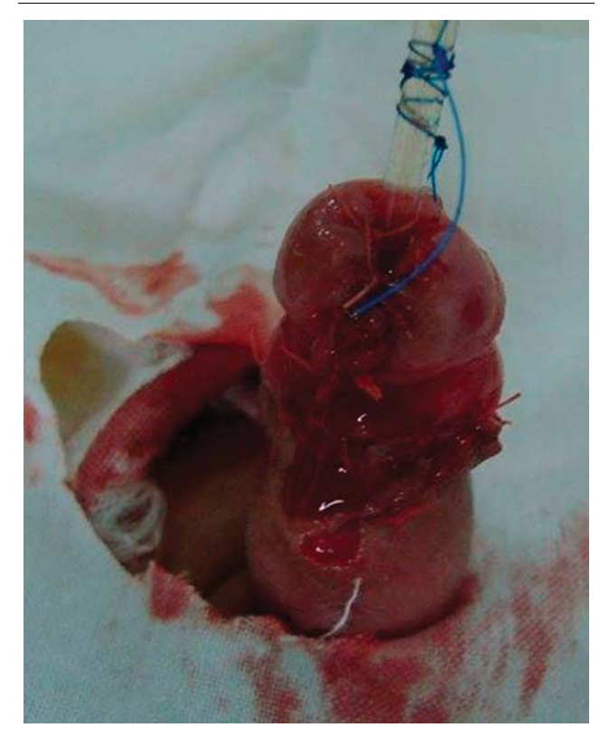
Glans wrapped around the urethra.