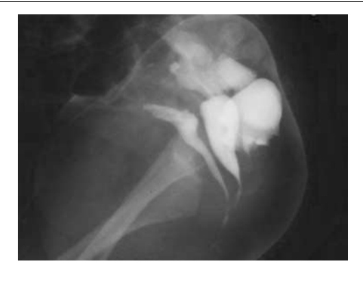
Genitogram showed the location of the urethra and vagina confluence and the urogenital sinus.