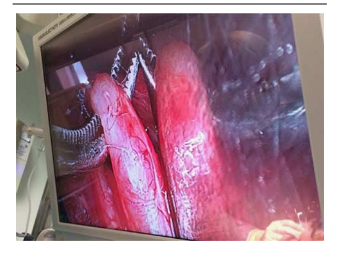
Dissection of esophageal segments to identify and repair fistula and to perform end-to-end anastomosis between proximal and distal esophageal pouches. We can observe amplified image of camera.

Actually, both techniques, open and thoracoscopic, are accepted for repair of EA with TEF.