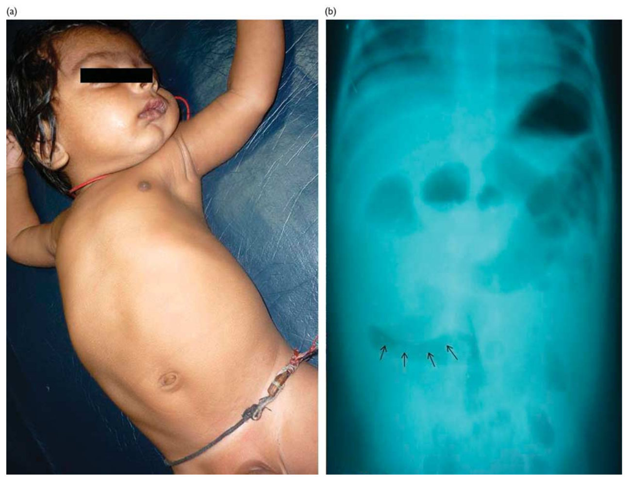
(a) Clinical photograph of an infant showing mild left-sided distension. (b) Erect abdominal radiography showing a round 'crescent-shaped radio-opaque shadow' in the distended terminal ileal loop (Renu's sign marked by black arrows).